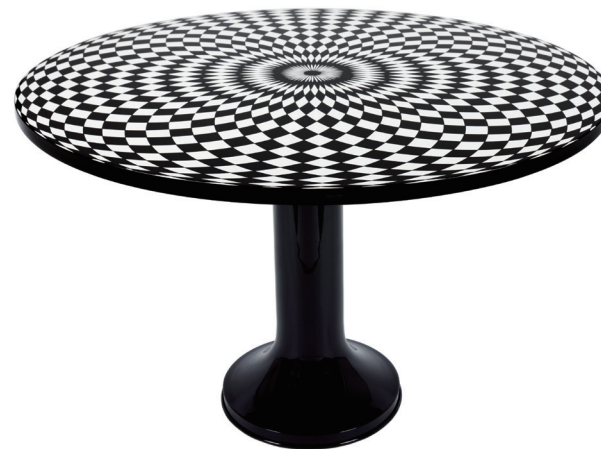
Table Top Optical m20 x 420 hr