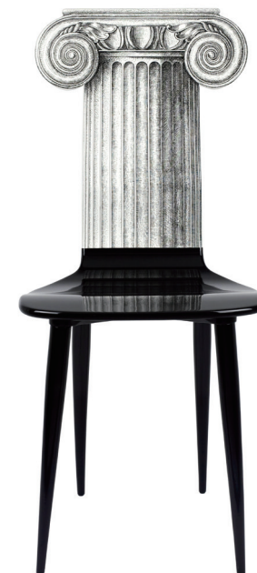
Chair Capitello Jonico m28 x 245 hr